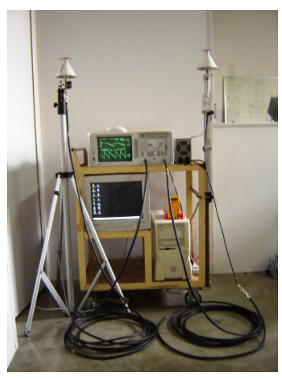
Figure 1 - Sounding System

The frequency channel sounding used a vectorial network analyzer (VNA) that swept the 910-1760 MHz band in 1601 frequency samples. Fig.1 shows the sounding setup [6] used and Table I shows the main characteristics of it.