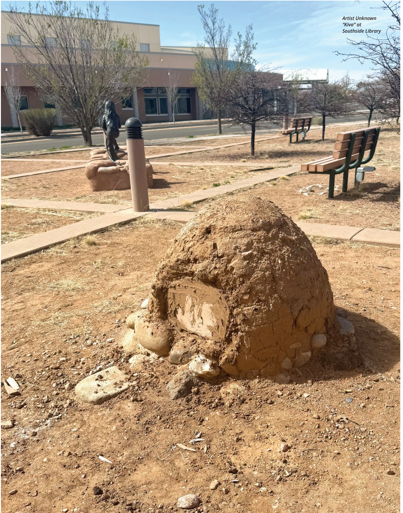
Artist Unknown "Kiva" at Southside Library