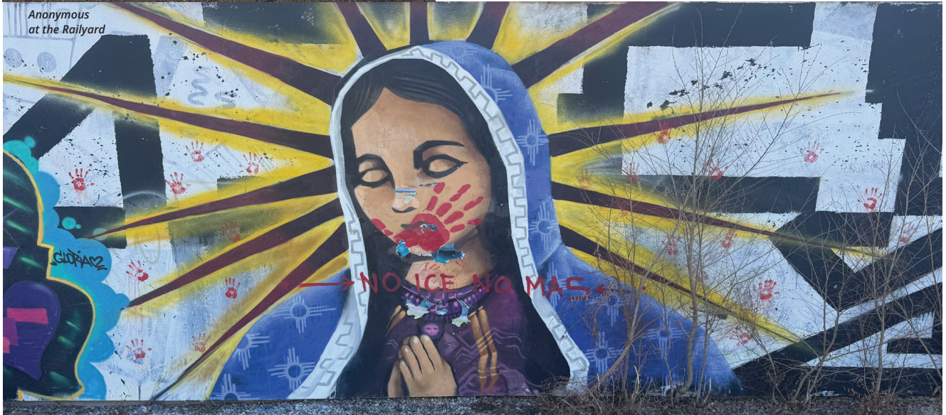
Anonymous at the Rallyard