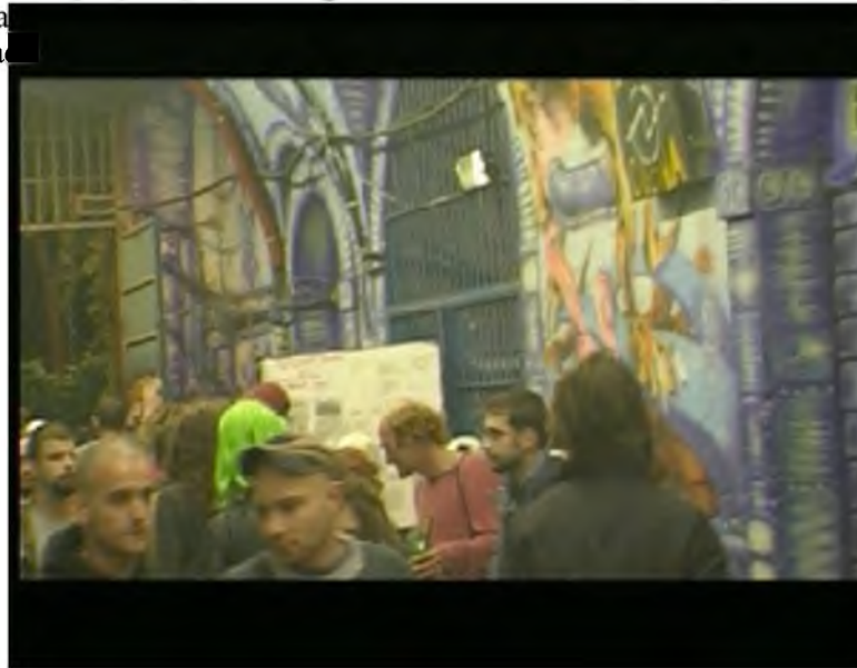
Picture 2. CSOA Forte Prenestino, entrance hall. September 2000.