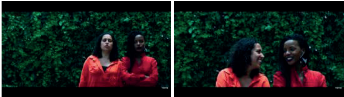
Frames 16 and 17 – Mandume