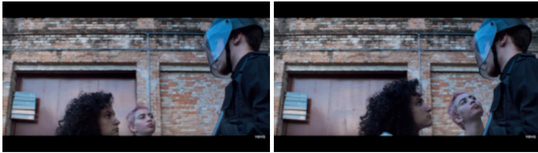
Retrieved from youtu.be/mC_vrzqYfQc