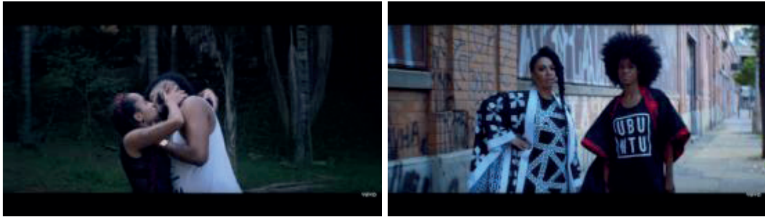
Frames 14 and 15 – Mandume

an affectionate and friendly relationship is built between them. The group of seven people also returns to the scene with their arms crossed and intensified looks, followed by a shot focusing on four of them in a slightly low angle, showing negative gestures and facial expressions even more emphatic.