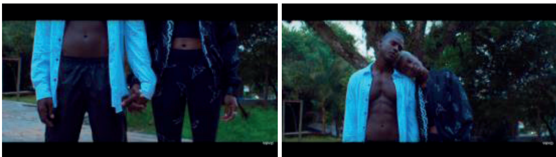
Frames 18 and 19 – Mandume

On the next scene, the couple wearing the same-model outfits affectionately intertwine their fingers (frame 18), on a frontal low angle shot, with their heads tilted toward each other (frame 19), so that their necks' angles and the black tone of their skins seem to merge with the tree branches on the background, shown by the camera moving upward (frame 20). Although the scene does not show the tree's roots, they make themselves present metaphorically, constructing a poetics of homage to their own roots through afrocentric affective relations, leading up to living ramifications, which extend upward beyond the frame. This shot is alternated with and followed by a shot of a Black shirtless man, also on a frontal angle, putting on a cap with the inscription "LAB" and crossing his arms, staring fixedly at the camera (frame 21).