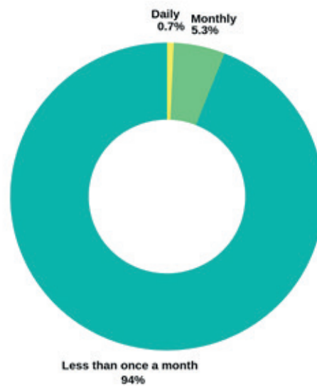
Figure 2: Profile picture updating frequency.