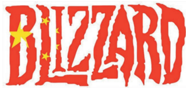
Figure 2 –Blizzard’s logo/Chinese National flag

Bree @BrizzleMcFizl – 08/10/19 12:06 Time to #BoycottBlizzard”.