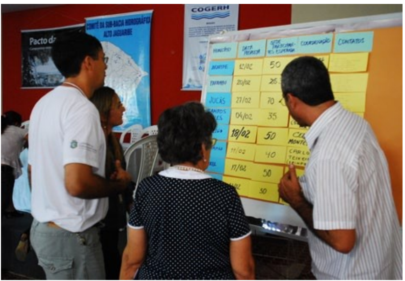
Figure 1. Exhibiting promises on index cards during one of the Pact workshops.

The Pact's third phase entailed the actual promise-making events at a variety of scales, beginning with municipal meetings and then at regional and state-wide events. At these events participants sat together to enunciate and write down their promises. The result was a large set of pledges first uttered in small groups, then written on coloured slips of paper or large sheets posted on walls, and finally turned into electronic documents. These promise-making events were temporally ordered in such a way that some promises could be scaled up. First, 156 municipal meetings were held, then representatives from each municipality came together in a series of regional events facilitated again by a Pact team member to establish inter-municipal and regional pacts. At this level, institutions could combine resources to fulfil each other's promises and address larger initiatives such as the construction of water treatment plants or solid waste management systems. Finally, representatives from each municipality and regional Pact attended a state-wide meeting where macro-pacts were produced, following the same promise-making methods.