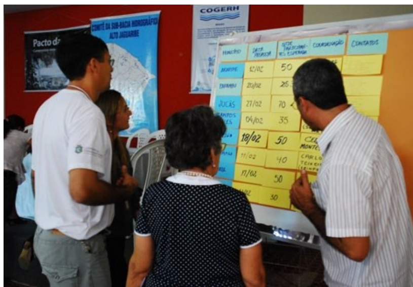
Figure 1. Exhibiting promises on index cards during one of the Pact workshops.

The Pact's third phase entailed the actual promise-making events at a variety of scales, beginning with municipal meetings and then at regional and state-wide events. At these events participants sat together to enunciate and write down their promises. The result was a large set of pledges first uttered in small groups, then written on coloured slips of paper or large sheets posted on walls, and finally turned into electronic documents. These promise-making events were temporally ordered in such a way that some promises could be scaled up. First, 156 municipal meetings were held, then representatives from each municipality came together in a series of regional events facilitated again by a Pact team member to establish inter-municipal and regional pacts. At this level, institutions could combine resources to fulfil each other's promises and address larger initiatives such as the construction of water treatment plants or solid waste management systems. Finally, representatives from each municipality and regional Pact attended a state-wide meeting where macro-pacts were produced, following the same promise-making methods.