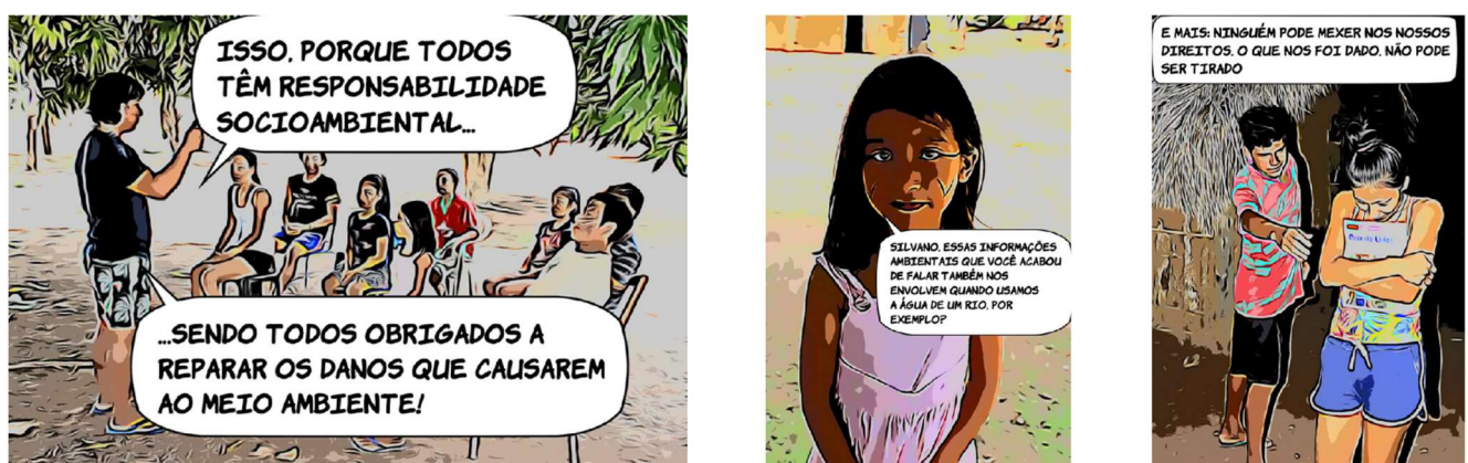
Figure 3 Three samples of pictures converted into cartoons by students

The group, then, transformed pictures into cartoons, using the app “Comica”, which converts photographs into cartoons and finalizes the comic book by including the corresponding speech bubbles to each image.