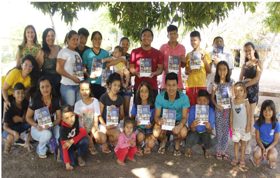
Figure 5. Event to launch the book in Vila Nova Barbecho. CEPAL/ONU, Regional Agreement on Access to Information, Public Participation and Justice in Environmental Matters in Latin America and the Caribbean. 2018. Available at: https://www.cepal.org/en/escazuagreement . Last access September 2022.