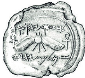
Figure 12: Drawing of King Hezekiah’s Bulla Seal stamp with the two-winged symbol flanked by the Egyptian ankh symbol. Upper register: “Belonging to Hezekiah, (son of) Abaz”. Lower register: “King of Judah”. (MAZAR, 2018, p. 180, Fig. II.1.4)