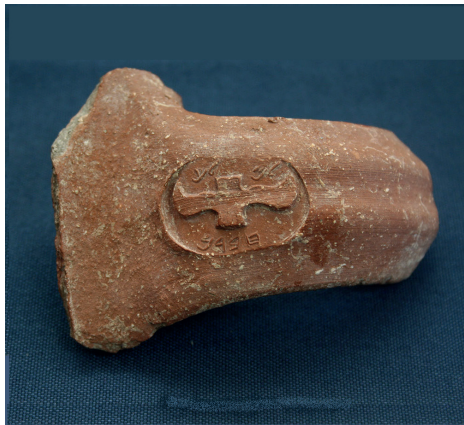
Figure 3: mlk jar handle. Photo: Oded Lipschits (YIRKA, 2017).