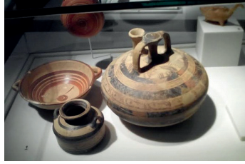
Figure 17: Philistine Bichrome Ware from Tel Ashdod. (ROSE, 2015).