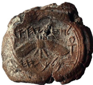
Figure 12: King Hezekiah’s Bulla Seal stamp with the two-winged symbol flanked by the Egyptian ankh symbol. Upper register: “Belonging to Hezekiah, (son of) Abaz”. Lower register: “King of Judah”. (MAZAR, 2018, p. 180, Fig. II.1.4)

The two-winged symbols (types IIa, IIb, IIc and XII) can be safely associated with King Hezekiah considering that: (1) the dates of these handles coincide with his period of reign; (2) the inscription they bear makes direct reference to a למלך/mlk/king ; and, most importantly, (3) nine bullae inscribed with the name Hezekiah have already been discovered and reported, all containing the same two-winged symbol (Fig. 12 and 13; CROSS, 1999; DEUTSCH, 2002; 2003a, p. 13-20; 2003b, p. 45-50; 2011, p. 76; MAZAR, 2018, p. 180, 183-184).