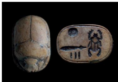
Figure 14: Scarab inscribed with the name of Pharaoh Amenhotep II, XVIII Dynasty. (ISRAEL MUSEUM, 1989, Accession Number 76.031.2108).