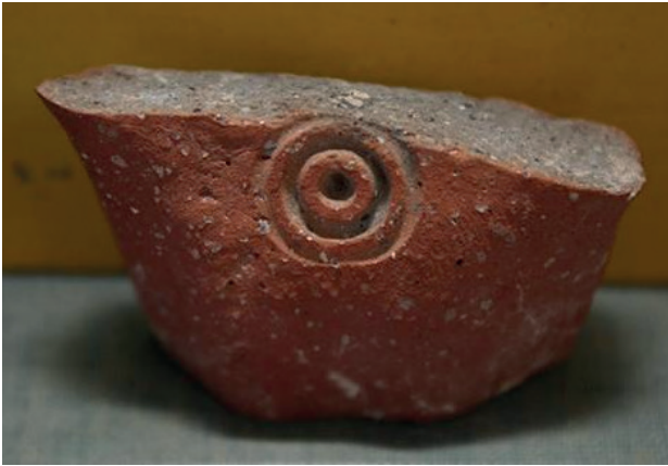
Figure 4: Jar handle incised with concentric circles, from Ramat Rahel. (LIPSHITS, 2017)