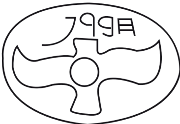
Figure 10: Type IIc

Two-winged symbol. Upper register: lmlk ("belonging to the king"). Lower register: name of a place (letters separated). (After GRENA, 2004)