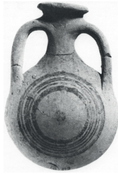
Figure 19: Philistine Ware from Tell Qasile. (MAZAR, 1985, p. 71, Photo 73)

The reconstruction here proposed fits the whole purpose of Senacherib's campaign, and explains why, soon after, concentric circles started to be incised next to lmlk stamps, as if nullifying the latter and disauthorizing the king of Judah, and why two different symbols – lmlk stamps and concentric circles – co-existed for some time in the cities of Judah. It seems to account for all the data presently available and may be summarized as follows: (1) the marks on jar handles were part of a royal taxation system; (2) the introduction of concentric circles occurred amid the circumstances generated by the military campaign of Sennacherib, which aimed to ensure the collection of tribute, (3) as a result of the Assyrian campaign, Judah lost control over the Shephelah, much of Judah's territory was given by the Assyrians to the Philistines, and Judah was forced to confine itself to the highlands; (4) the concentric circles were imposed by the Assyrians on the Judahites, indicating that the storage jars thus marked were