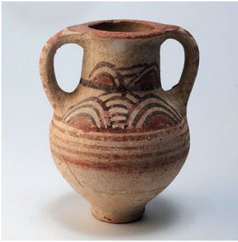
Figure 18: Philistine Bichrome Ware from Tell Ashkelon. (ISRAEL MUSEUM, 2016)