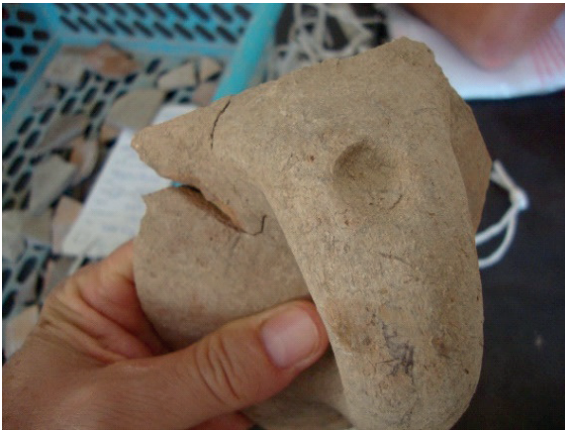
Figure 5: Finger-impressed jar handle, from Khirbet Qeiyafa. Photo by the author, 2013.

The probable function of all these different marks has generally been inferred from the Hebrew inscription that appears on a set of them, the aforementioned lmlk handles – ללמל “ belonging to the king ” or “ for the king ” – suggesting that they were royal emblems (WARD, 1968; TUSHINGHAM, 1970; 1971; AVIGAD & BARKAY, 2000, p. 243; FOX, 2000, p. 220-223; HUDON, 2010, p. 31-32; NAAMAN, 2016, p. 114-116), perhaps used to identify jars used to collect taxes, probably in the form of shares of wine, oil and grains (KLETTER, 1998, p. 145-147; ZIMHONI, 2004, p. 1706;