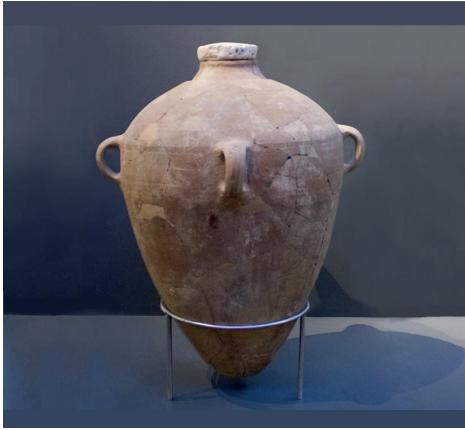
Figure 2: mlk -stamped jar, from Tel Lachish. (ISRAEL MUSEUM, 1975, Accession Number IAA 1975-246).

The evidence, therefore, suggests that such a practice had a long history and was typically Judahite. Although using different iconographic motives, it may have continued in Judah/Yehud/Judea even after the extinction of the Kingdom of Judah in 586 BCE (STERN, 2001, p. 175; LIPSCHITS, SERGI & KOCH, 2011; cf. ARIEL & SHORAM, 2000; AVIGAD, 1957; 1958; VANDERHOOFT & LIPSCHITS, 2007; STERN, 1971).