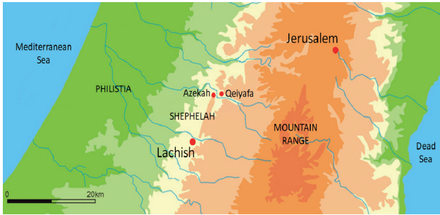
Figure 1: Area of highest concentration of jar handles stamped with the lmlk seals and/or incised with concentric circles.