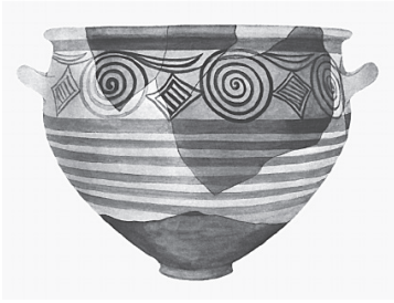
Figure 16: Philistine Bichrome Ware from Tel Beth-Shemesh. (BUNIMOVITZ & LEDERMAN, 2011, p. 40, Fig. 4)