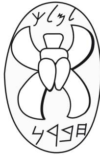
Figure 7: Type Ib

Four-winged Symbol. Cursive inscription. Upper register: lmlk ("belonging to the king"). Lower register: name of a place. (After GRENA, 2004)