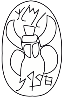
Figure 6: Type Ia

Four-winged Symbol. Cursive inscription. Upper register: lmlk ("belonging to the king"). Lower register: name of a place. (After GRENA, 2004)