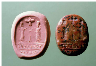
Figure 15: Seal with the inscription “Amos, the scribe”. At the top, the winged symbol. (ISRAEL MUSEUM, 1978, Accession Number 71.065.0177)