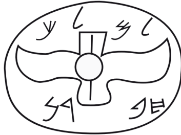
Figure 9: Type IIb

Two-winged symbol. Upper register: lmlk ("belonging to the king"). Lower register: name of a place (letters clustered). (After GRENA, 2004)