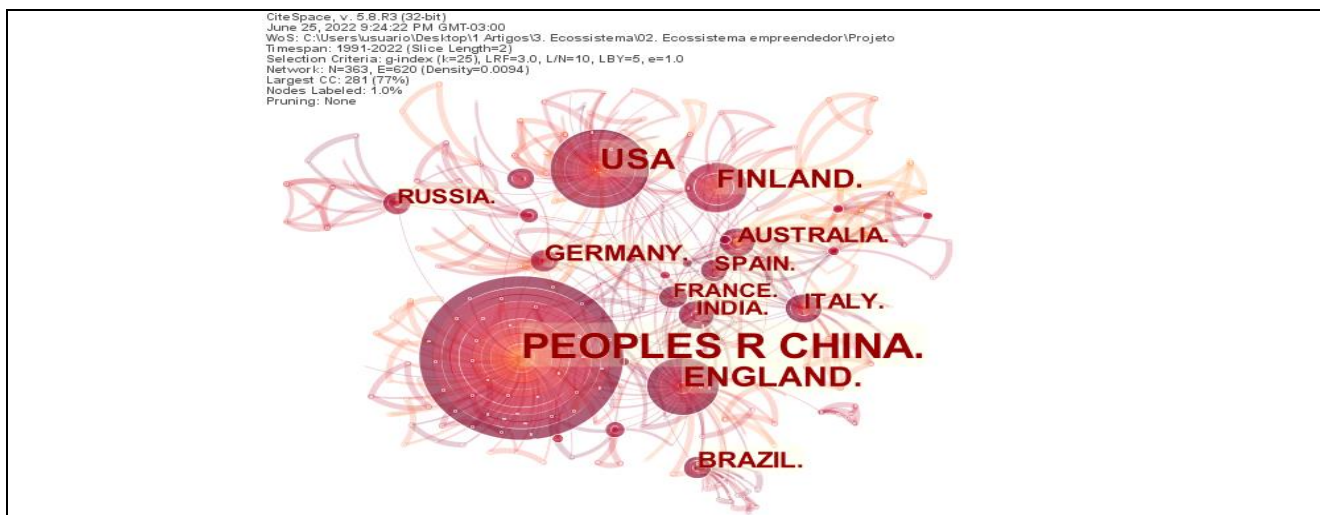
Picture 2. Co-authorship network between countries.

Based on Frame 2, it is possible to learn that the representativity of developed and/or underdeveloped countries is small, to the extent that the most significant papers are concentrated, mostly, in well-developed countries. Furthermore, Picture 2 shows the co-authorship between countries. The centrality refers to the number of publications compared to the other countries. Therefore, the knot size indicates the country's centrality, the greater the knot, the greater the number of publications about the other countries. The most central countries are China, the United States, England and Finland.