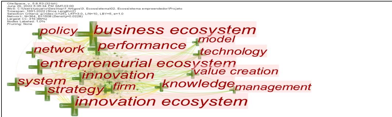
Picture 3. Keywords co-occurrence.