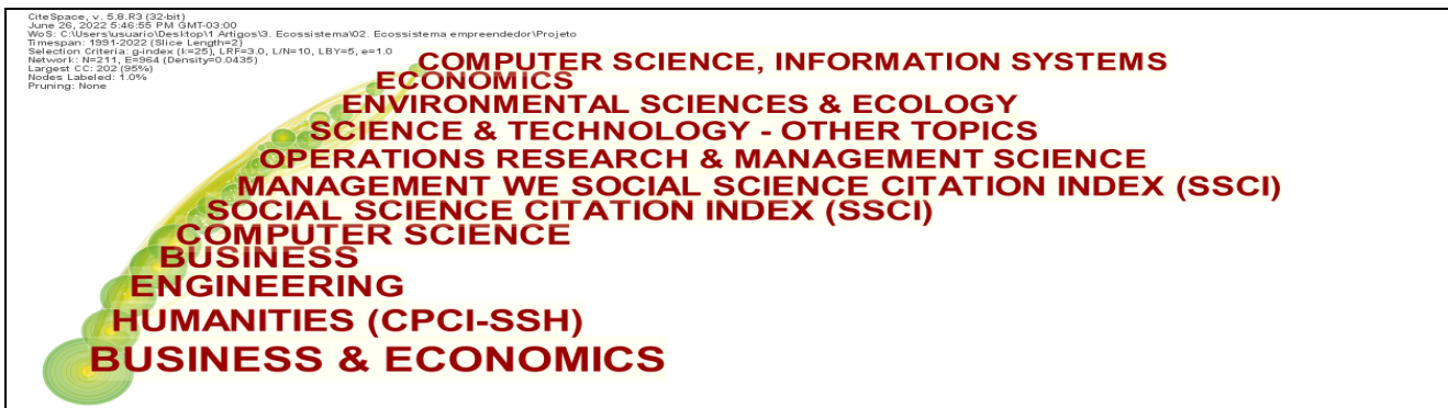
Picture 4. The Web of Science database main collection categories.