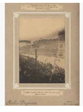
Figure 2: Photograph in a cardboard frame. Upper caption: Commemoration in Rio de Janeiro of the 1st Anniversary of the demiseof Marechal Deodoro (Original caption). Lower caption: the procession of the civic cortège from the front of Catete to the new Governor's palace (original caption).

The first anniversary of the death of Floriano Peixoto also followed this apotheosis with a large civic procession through Rio de Janeiro with various representatives of civilian and military society in which the PCB stood out, together with the Military Club, the National Guard, the Federal Republican Party and the School of Medicine, among other associations. In the years that followed, there continued to be visists to the tomb of Floriano Peixoto on the anniversary of his death.