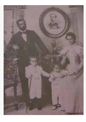
Figure 01: Photograph

It is clear that some kind of visual support was essential for a personalized and civic cult which could ensure that the visual memory of Floriano Peixoto would be preserved among many other national military heroes. These images were made public by the press and gave political publicity to the electoral campaign of 1894 and the first year of the government of Prudente de Morais, who had to endure fierce opposition on the part of the florianists. The images were thus an essential means of fostering a visual culture with popular political pretensions. Figure 1 below, shows a photo of a family with Floriano Peixoto in the background.